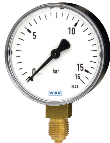
Bourdon tube pressure gauge model 111.10